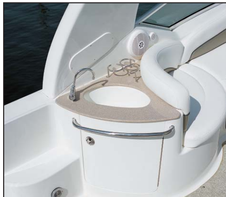
Elegant cockpit wet bar features Corian® countertop and stainless steel faucet.