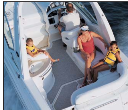
Comfort comes standard with this luxurious and open cockpit designed for sunning and entertaining.