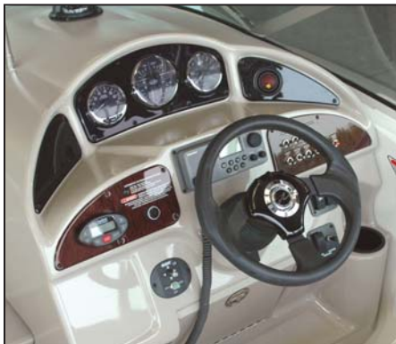
This handsome new black coral and burl control station is fully equipped with custom Sea Ray SmartCraft™ instruments.

The sleek new design is only one of the many premium upgrades we've made on this roomy new 260 Sundancer. Typical Sea Ray ergonomics designed throughout make this boat rival any other in its class. We've also added a translucent deck hatch with locks and sky screen cover, plus a transom storage compartment with gas-assisted lid. It's the best boat in its class, with all the extras you would expect from a much larger, more expensive cruiser.