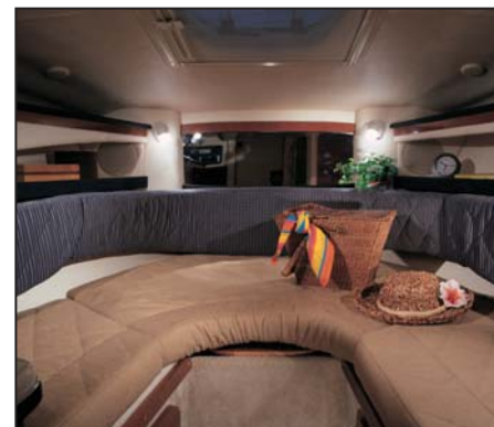
Rich textures and designer fabrics make this roomy V-berth attractive and comfortable.

Sea Ray Boats, 2600 Sea Ray Blvd., Knoxville, TN 37914. For information call 1-800-SRBOATS or fax 1-636-326-3282. Internet address: http://www.searay.com Note: Not all accessories shown in pictures or described herein are standard equipment or even available as options. Options and features are subject to change without notice. Not all model year boats may contain all the features or meet the specifications described herein. Confirm availability of all accessories and equipment with an authorized Sea Ray dealer prior to purchase. Printed in the U.S.A. July 2004 ©Sea Ray Boats.