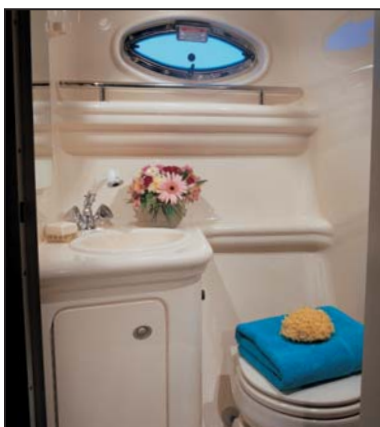
This comfortable head and shower compartment is fully enclosed and features a sink, vanity, and VacuFlush® head.