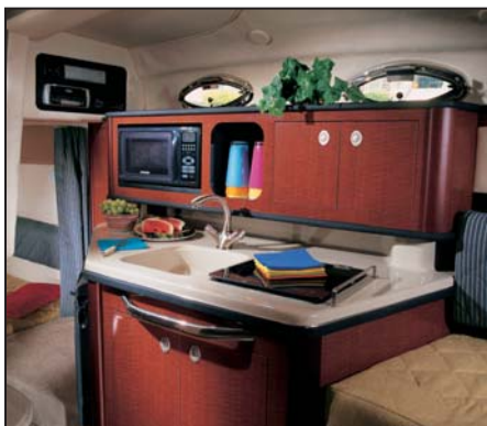
This tastefully appointed galley comes well equipped with a molded-in sink, dual-voltage refrigerator, microwave, and butane stove.